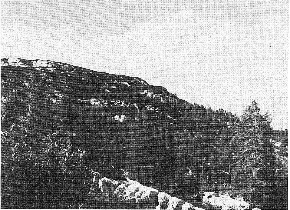
FIG. 2 - The larch forest line above the valley of the Triglav lakes.

also by Man. The lighter woodland along the forest line was mostly cleared away in order to make land available for alpine pastures. The natural forest line was thus pushed downwards. A new, secondary, man-made forest line has come into existence. Later on, when the number of domestic animals on alpine pastures decreased, the role of the grazing along the forest line began also to decrease and the trees slowly tended to regain the lost ground at higher altitudes. Such a man-made forest line, however, has remained on more gentle slopes where the grazing has continued.