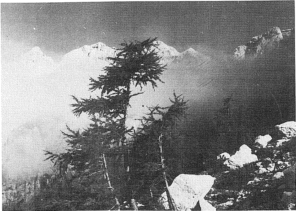
FIG. 1 - The typical form of larch crown on the forest line in the central part of the Julian Alps.

The less inclined parts of the surface were affected by the formation of several karst phenomena (karren, limestone pavements, grooves etc.) and are, thus, very irregular and uneven. In such places, covered only irregularly with thin soil, no contiguous tree growth is possible. Therefore the forests are rather thin and clear woodlands are typical of the central parts of the Julian Alps.