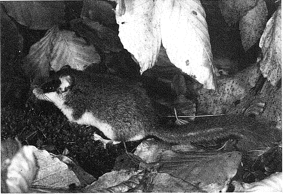
FIG. 1 - Adult of Dryomys nitedula (Pallas).